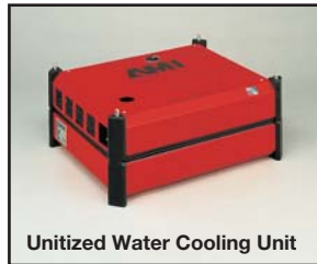
Unitized Water Cooling Unit