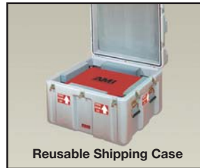
Reusable Shipping Case

Additional accessories available, but not shown include: