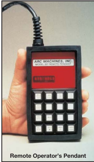
Remote Operator's Pendant

While the basic Model 207 and an appropriate weld head are all that you need to weld tube or fittings, many desirable options are available: