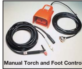
Manual Torch and Foot Control