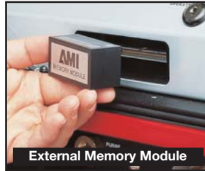
External Memory Module