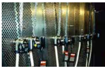
TUBE-TO-TUBESHEET GTAW (TIG) WELD HEAD

Visit arcmachines.com for more information.