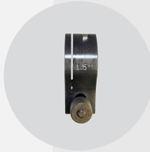
Off-Set Cutting Slot