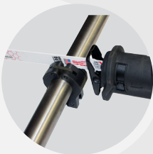
For use with Recipro Saws