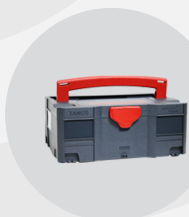
Available in Sets